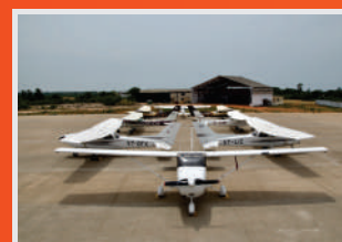
Versatile Fleet Of Aircraft