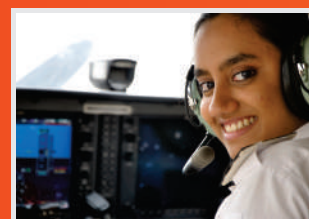
Modern Aircraft equipments