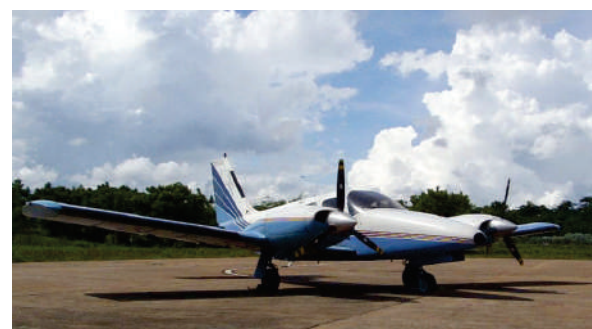
Multi-Engine Piper Seneca III

The AL50 has been used by Orient Flights for imparting thousands of hours of training for Pilot's, Engineers & aviation enthusiasts. In 2017, Orient Flights added the advanced ALSIM AL250 Multi-Engine Aircraft Simulator to its fleet, and have also entered into a technical partnership with ALSIM Simulators which led to the establishment of the SIM CENTRE at Chennai.