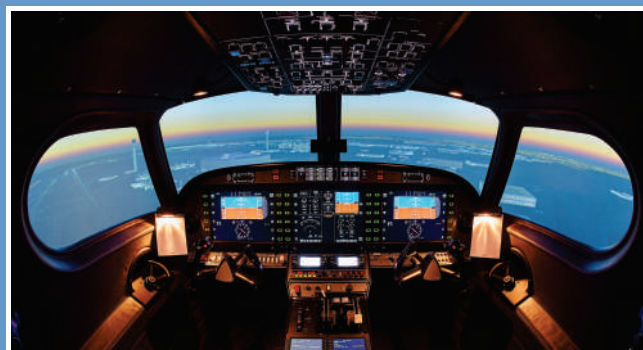
ALSIM AL 250 Flight Simulator