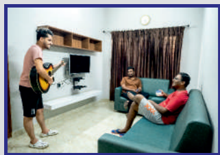
Hostel - Boys & Girls

Orient Flights Aviation Academy carries a legacy of more than 29 years marking almost three decades in 2024, logging more than 45,000 Hours and training more than 700 Pilots under highly qualified and experienced instructors. Orient Flights Aviation Academy has set the benchmark for aviation training to realise the dreams of aspiring pilots.