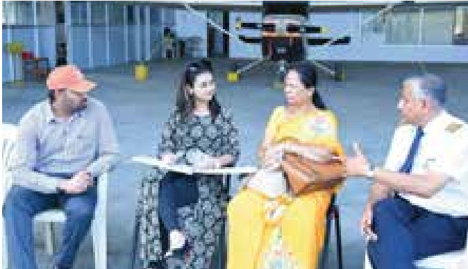
Actress Ms.Amoolya visited the Hangar